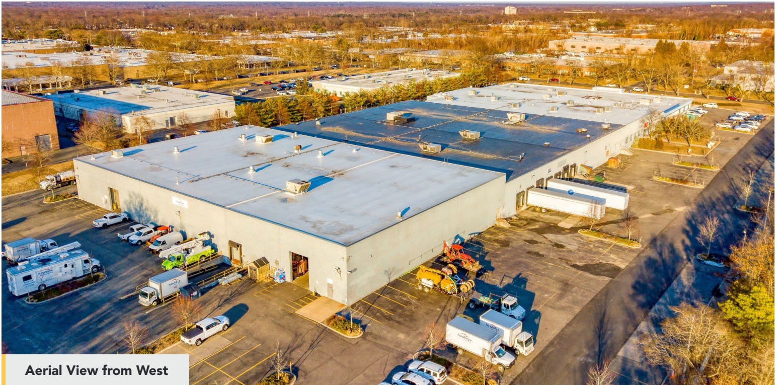
Aerial View from West