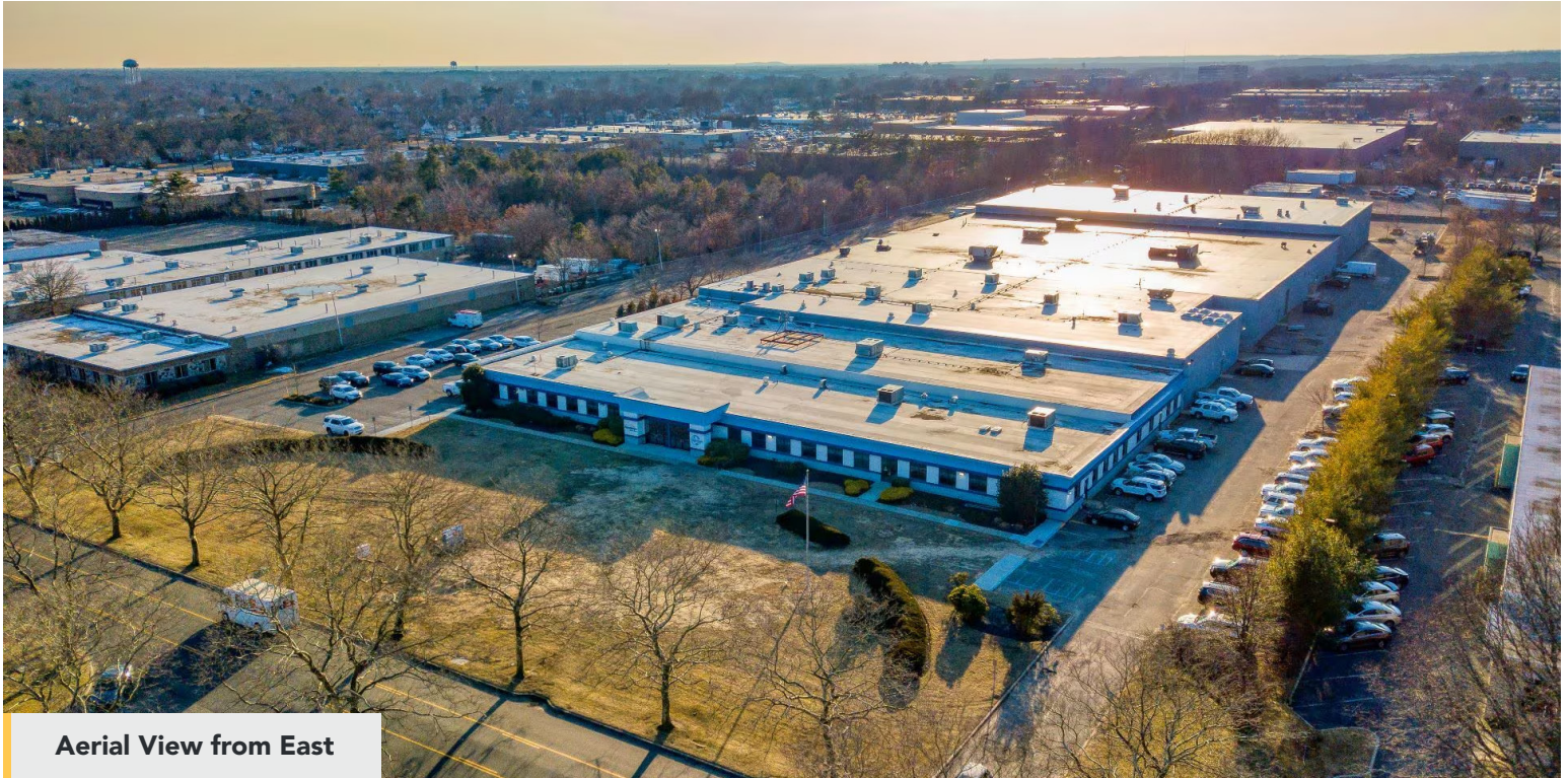
Aerial View from East

Office Space For Sub-Lease at Hauppauge Industrial Park