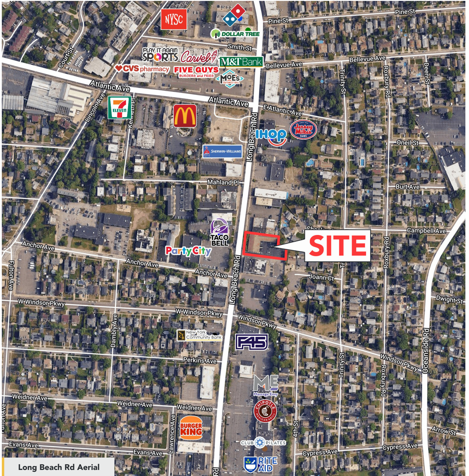
Long Beach Rd Aerial