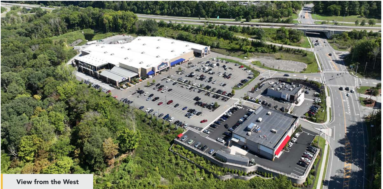
View from the West