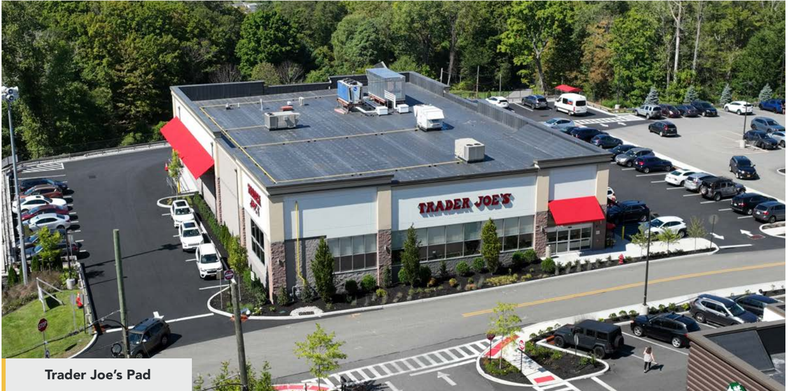
Trader Joe's Pad