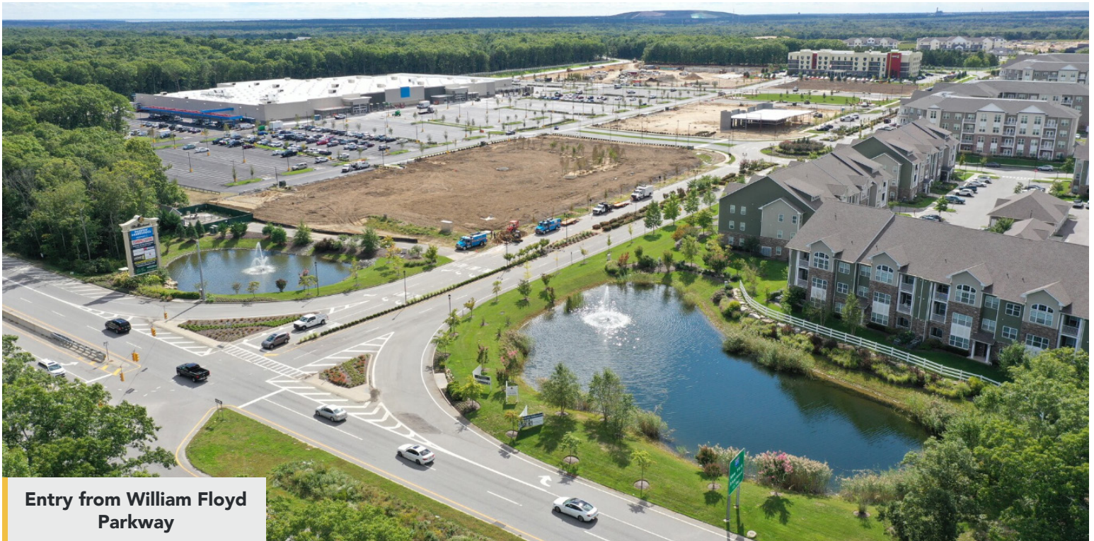
Entry from William Floyd Parkway