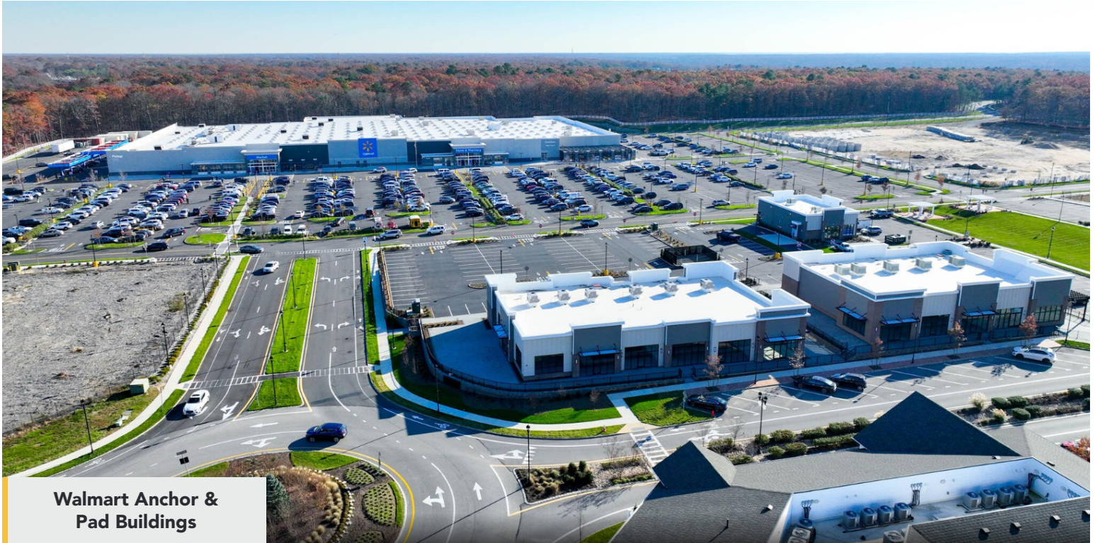
Walmart Anchor & Pad Buildings