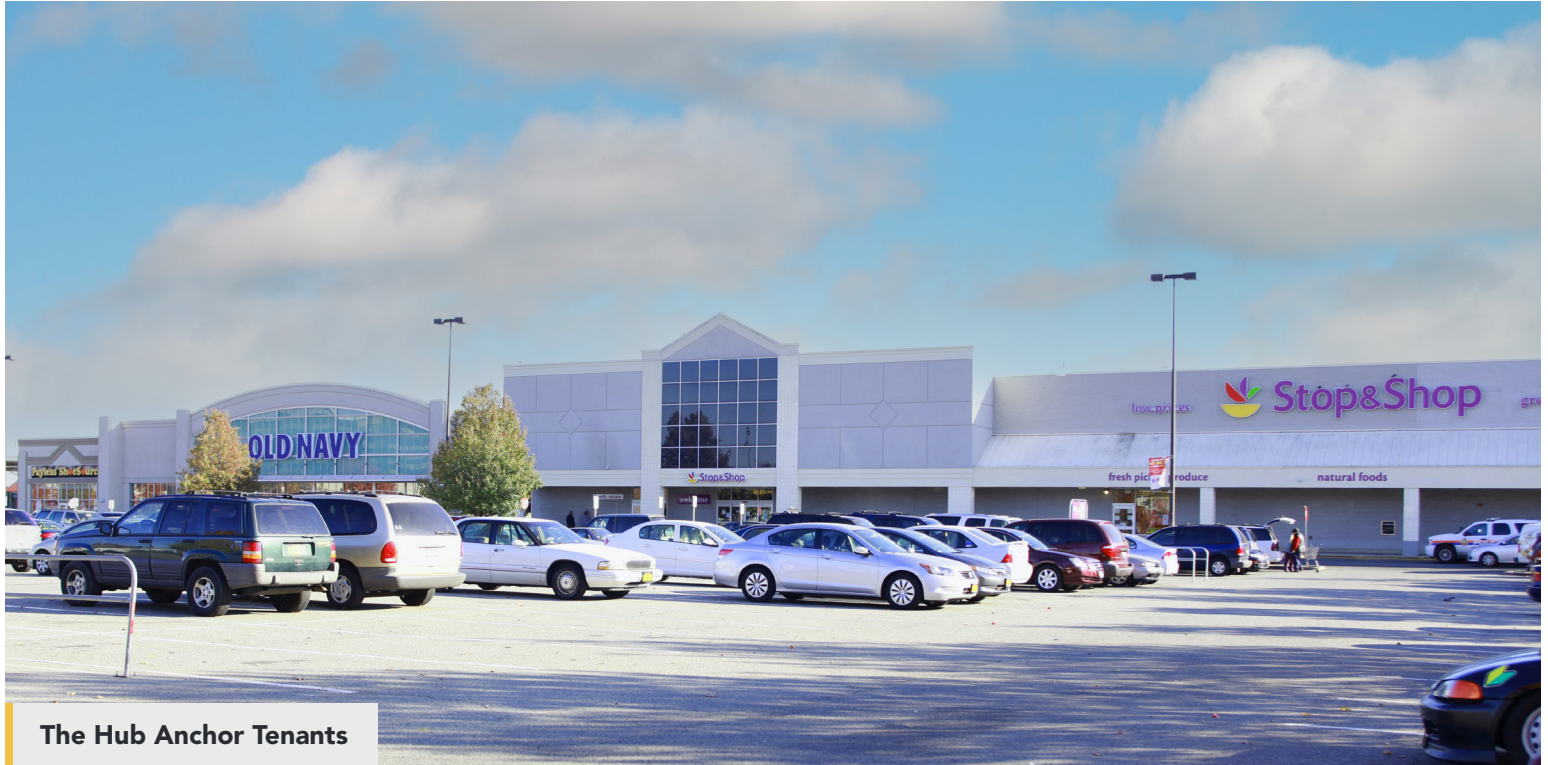
The Hub Anchor Tenants