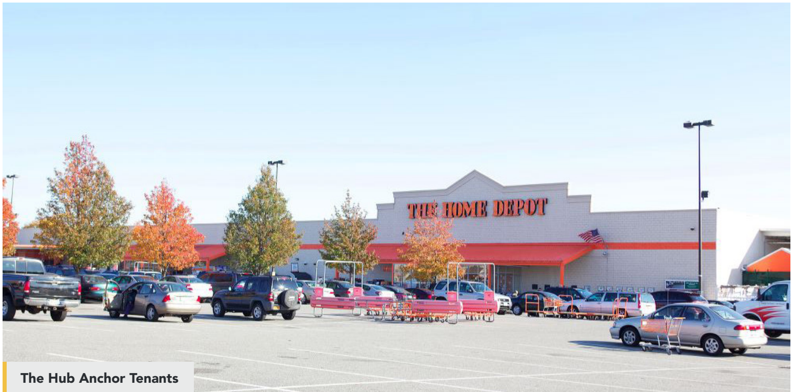
The Hub Anchor Tenants